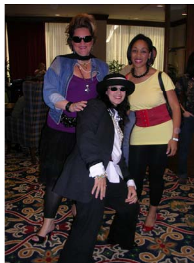
TASFAA Conference "80's" Night!